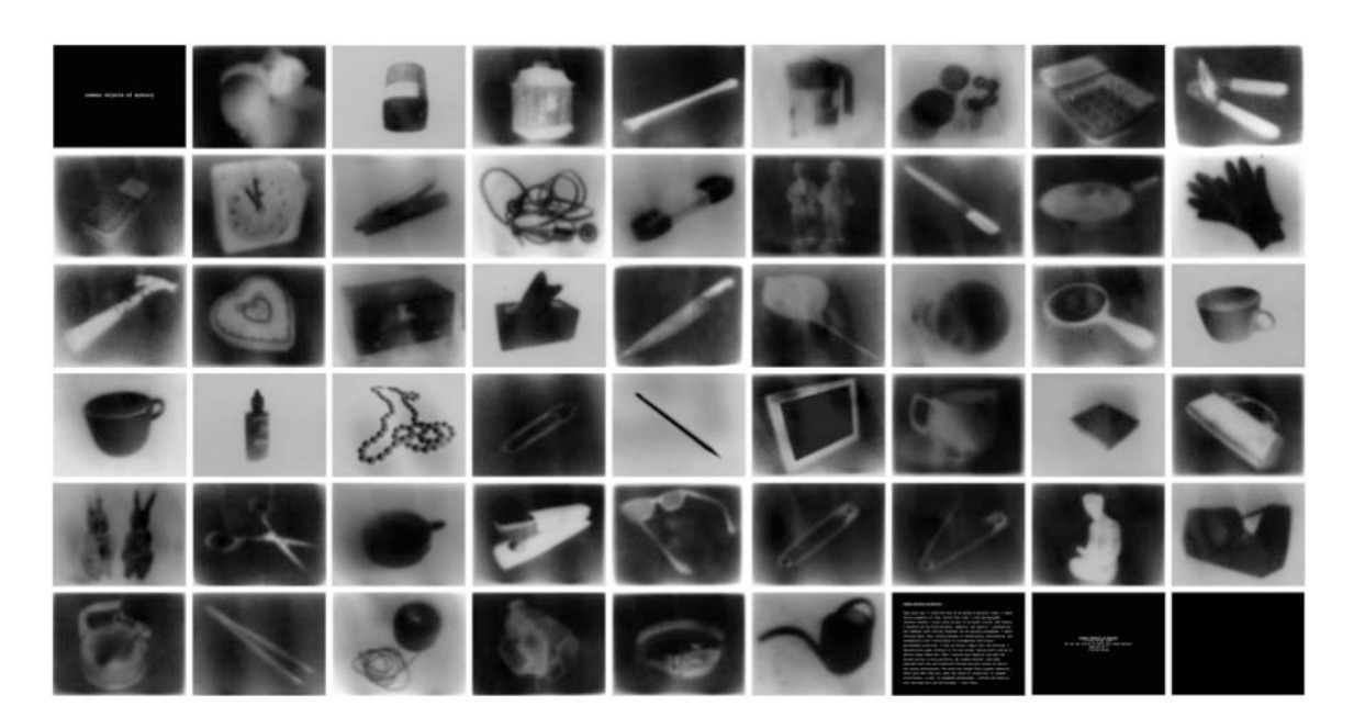
2. Lisa Young, photography faculty Title: common objects of mystery Medium: Ink jet prints on Epson hot press neutral