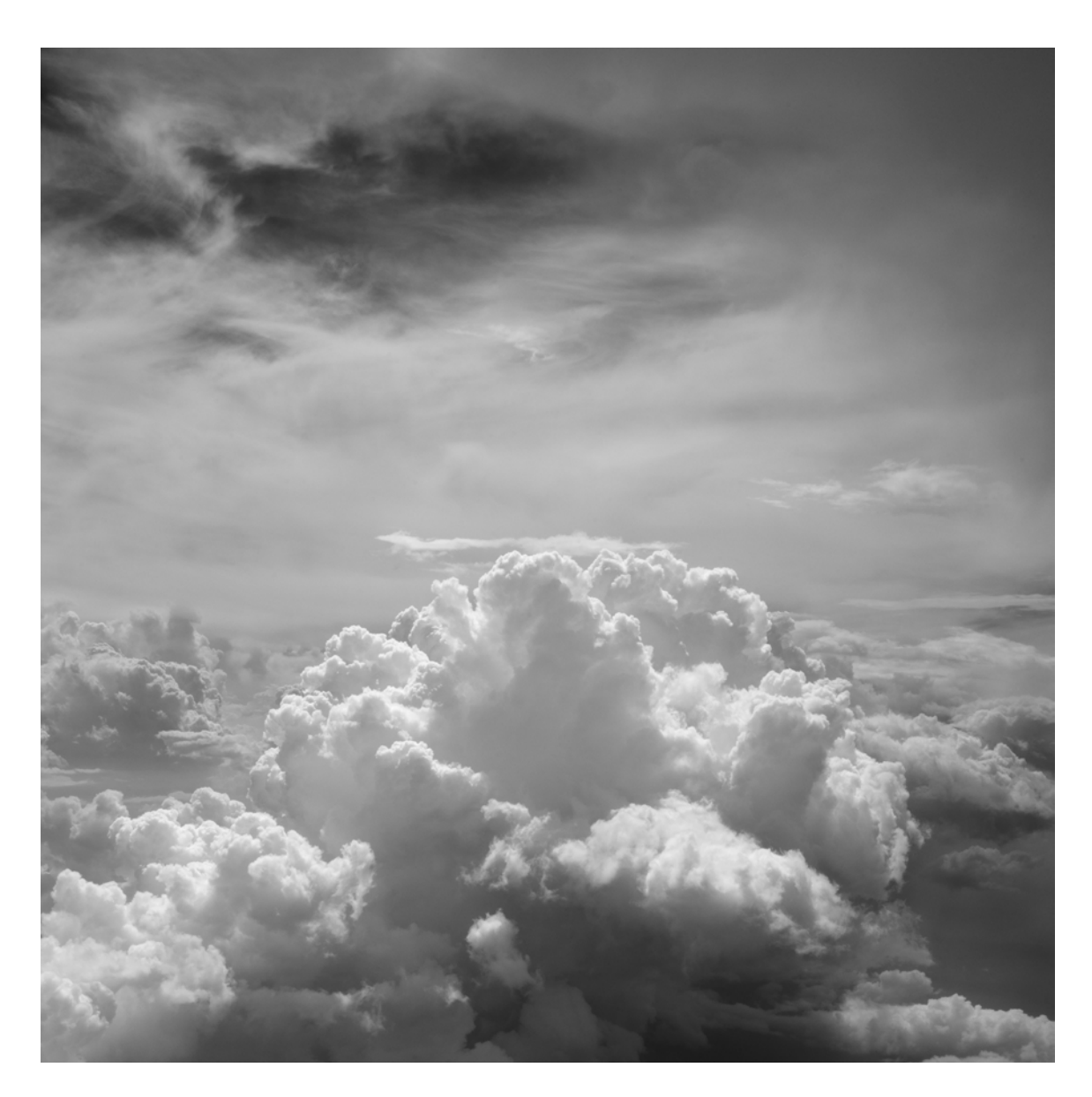
5. Matthew Clowney, Photography faculty Title: 33deg 28 '10"x86deg 59' 1" Medium: Archival inkjet print