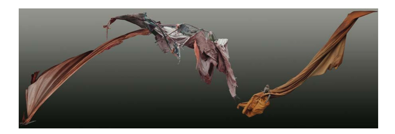
3. Eva Sutton, Photo faculty Title: Birds of Paradise #3 Medium: Digital C print